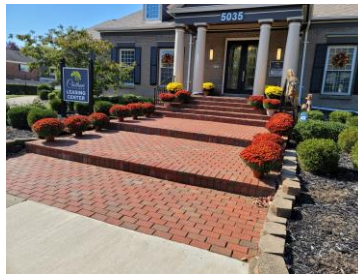
Chatham Village Apartments Kettering

We're grateful to supply these fine folks and more!