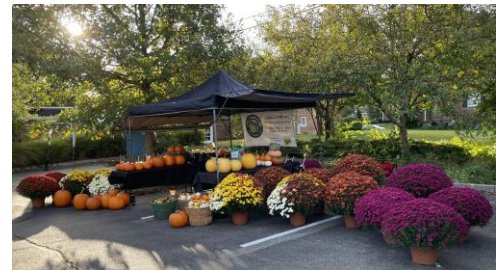
Local Farmers Markets