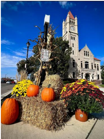
City of Xenia Harvest on Main

We're grateful to supply these fine folks and more!