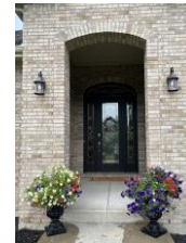
Individual Homeowners and Long-time Customers