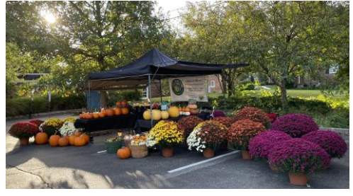
Local Farmers Markets